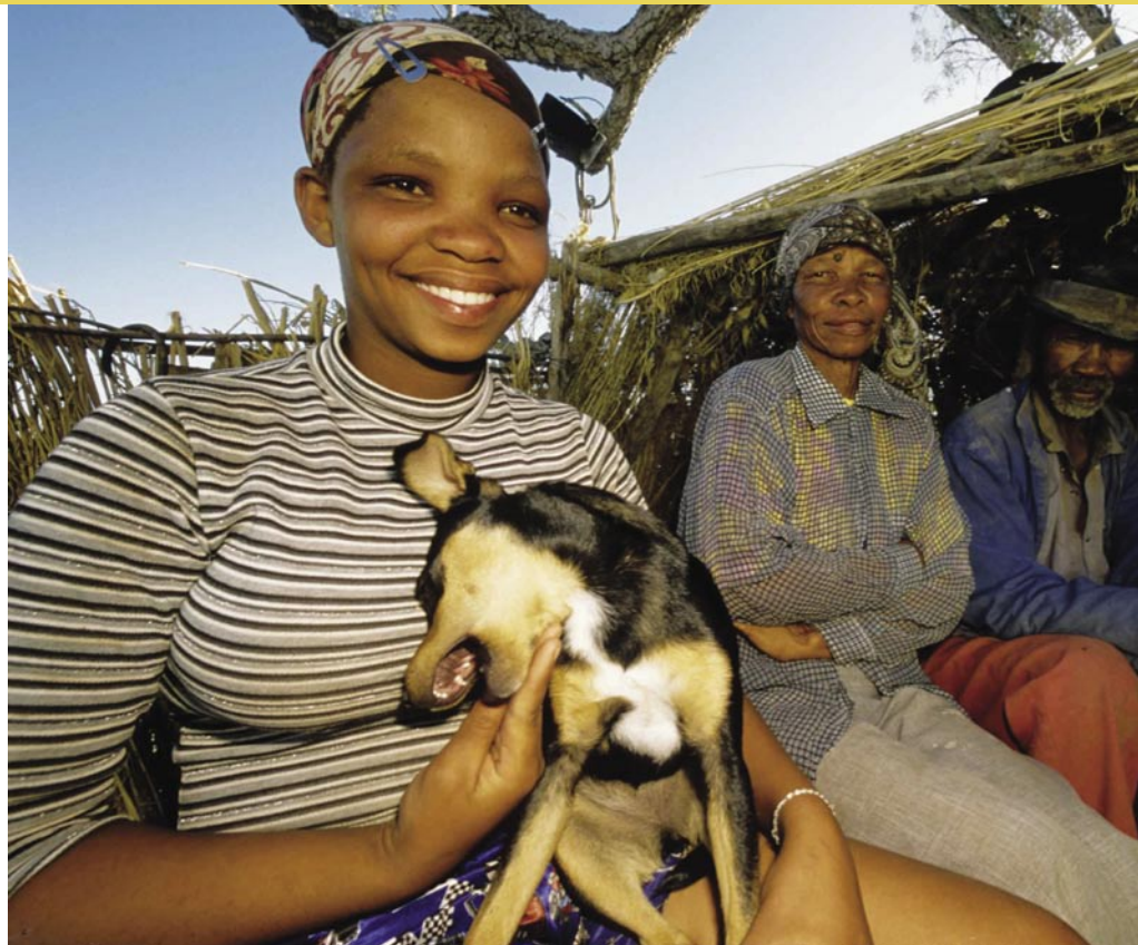
ABOVE: The Nama have been raising goats and sheep in the area's rugged desert mountains for close to two thousand years. BELOW: Map by Eco-Africa.

The idea of conserving the Richtersveld for future generations developed after members of the Eksteenfontein Youth Forum visited a petroglyph site along the Orange River in 1997. They were appalled to discover that some of them