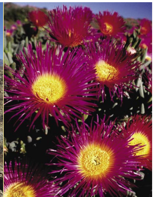
ABOVE: Cephalophyllum spongiosum. The Conservancy is considered to be a central part of the !Gariiep Centre of Endemism: an area recognized as having the richest variety of succulent plants (primarily the Mesembryanthemaceae family) on earth.